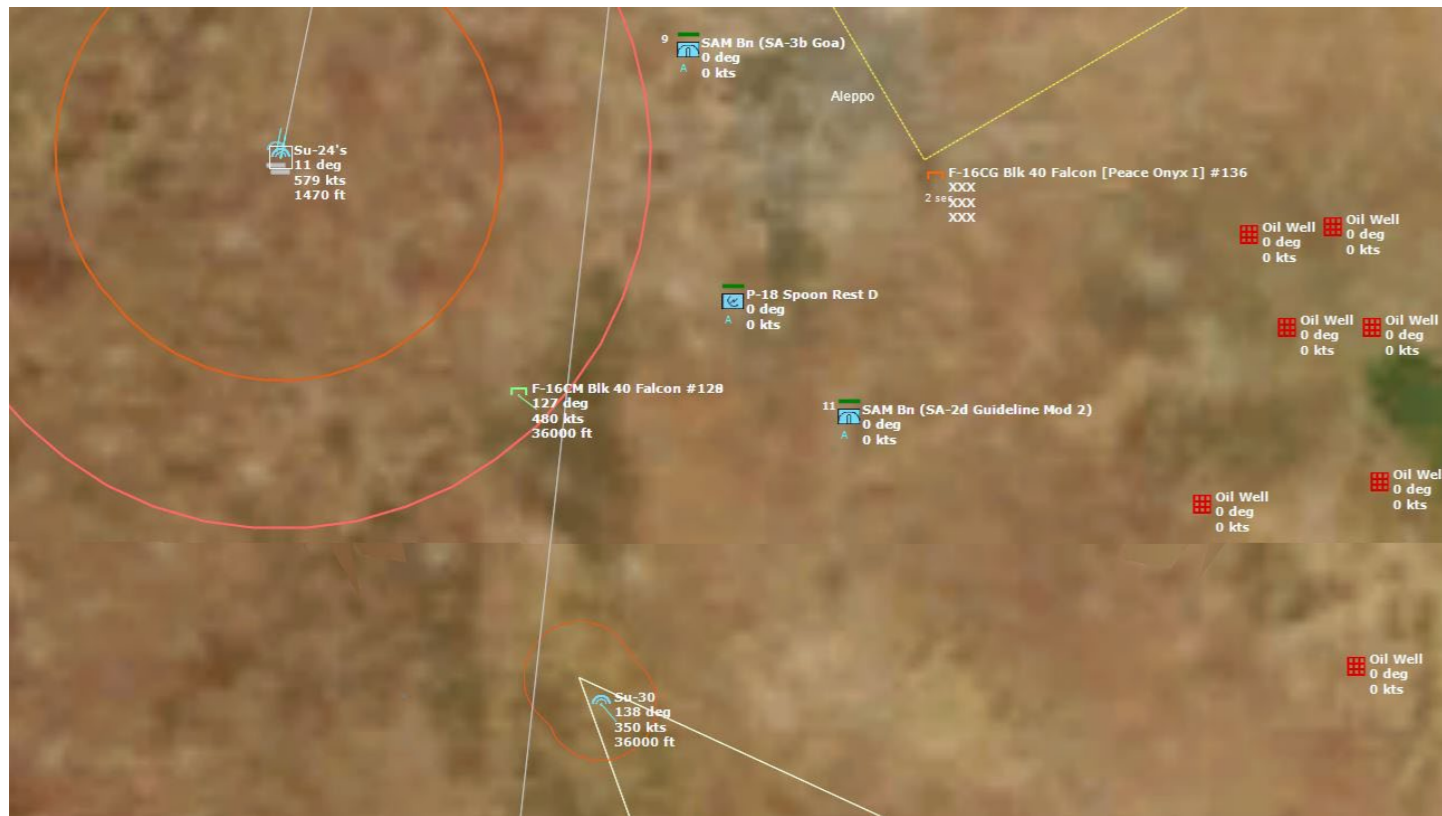
American and Turkish F-16's flying over strategic positions.

ground attack role with air-to-air missiles fired unguided to the ground. A lack of tactical fighters also saw helicopters used to drop barrel bombs on rebel-held areas, with large civilian casualties. AAA and rebel MANPADS also took its toll, with the SyAAF also suffering from defections and poor maintenance and availability.