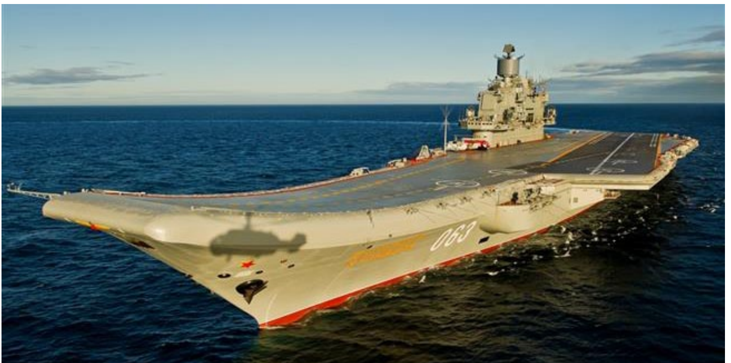
Russia's Admiral Kuznetsov aircraft carrier heading to Syrian waters.