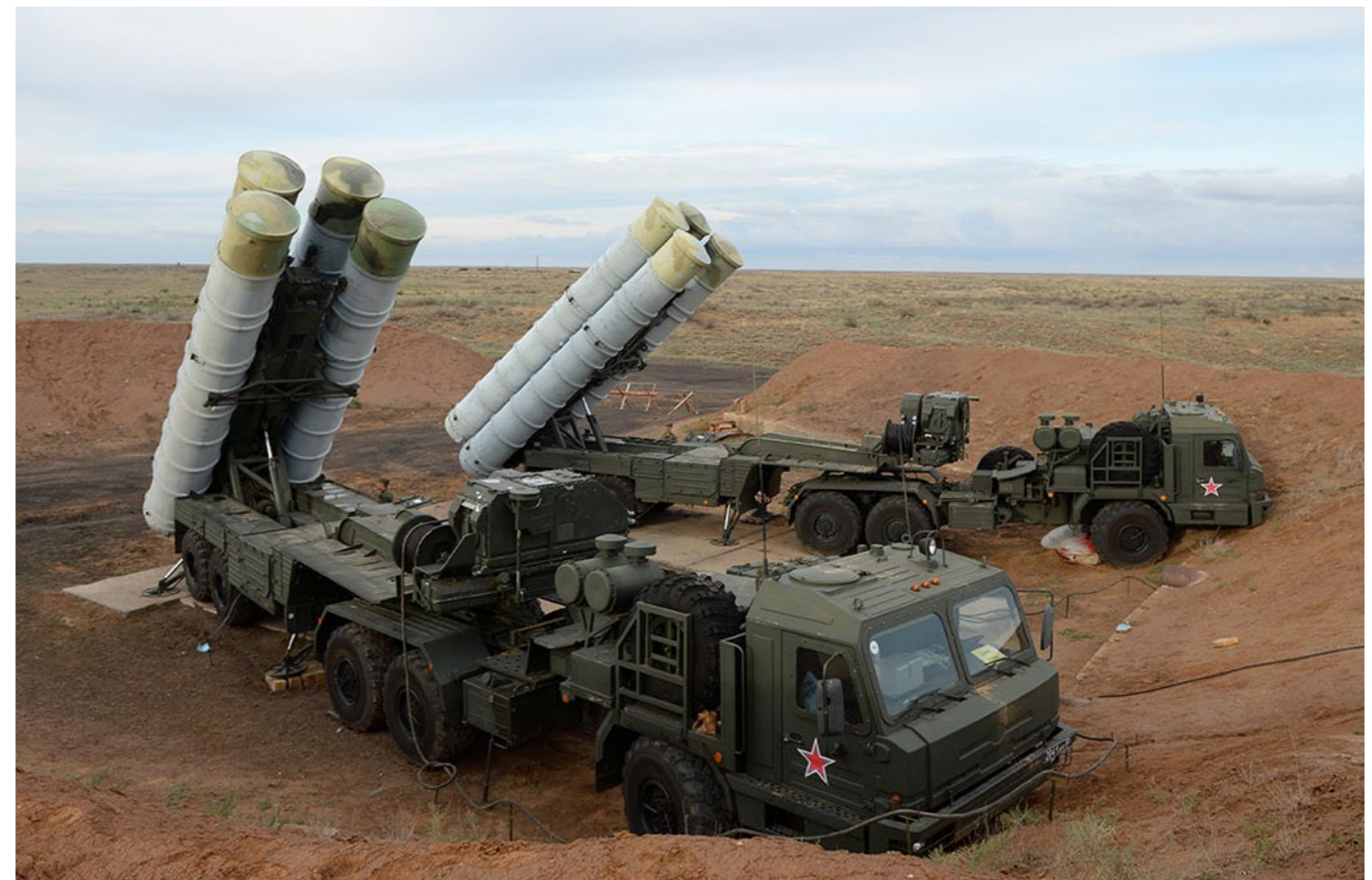
S-400 Triumph batteries deployed to Syria by Russia after the Turkish shoot down of a Russian Su-24.

Fifth – while this has been a short deployment compared to NATO's involvement in Afghanistan, it shows Russian now flexing its expeditionary muscles, to support an air campaign far from home. This takes substantial amounts of air and sea logistics. In addition, some Western observers were surprised at the reported high-level of operational tempo that the Russian VKS forces in Syria achieved. This may have been due to the fact it was planned