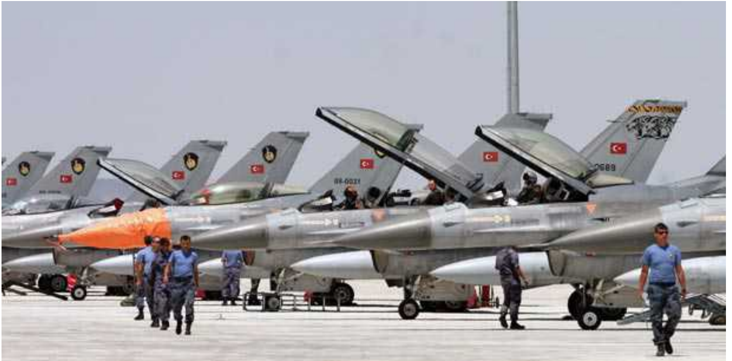
Turkish F-16 get ready to take off.

as a short-term 'surge', rather than a sustained operation – but it does indicate that Russia is now capable of these sort of 'out-of-area' expeditionary air campaigns that previously only the West could manage.