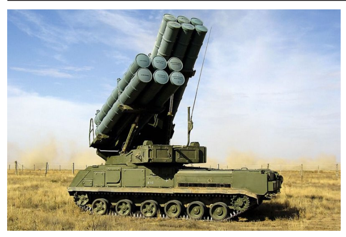
9A316M launcher of the Buk-M3 surface-to-air missile system.

Beirut, Lebanon – adding that the aircraft had been in action on already on 'two fronts' – a clear message that Israel was now operational with a platform that penetrate these A2/AD threat zones. In any future conflict then, IAF F-35Is will be at the tip of the spear in locating and destroying