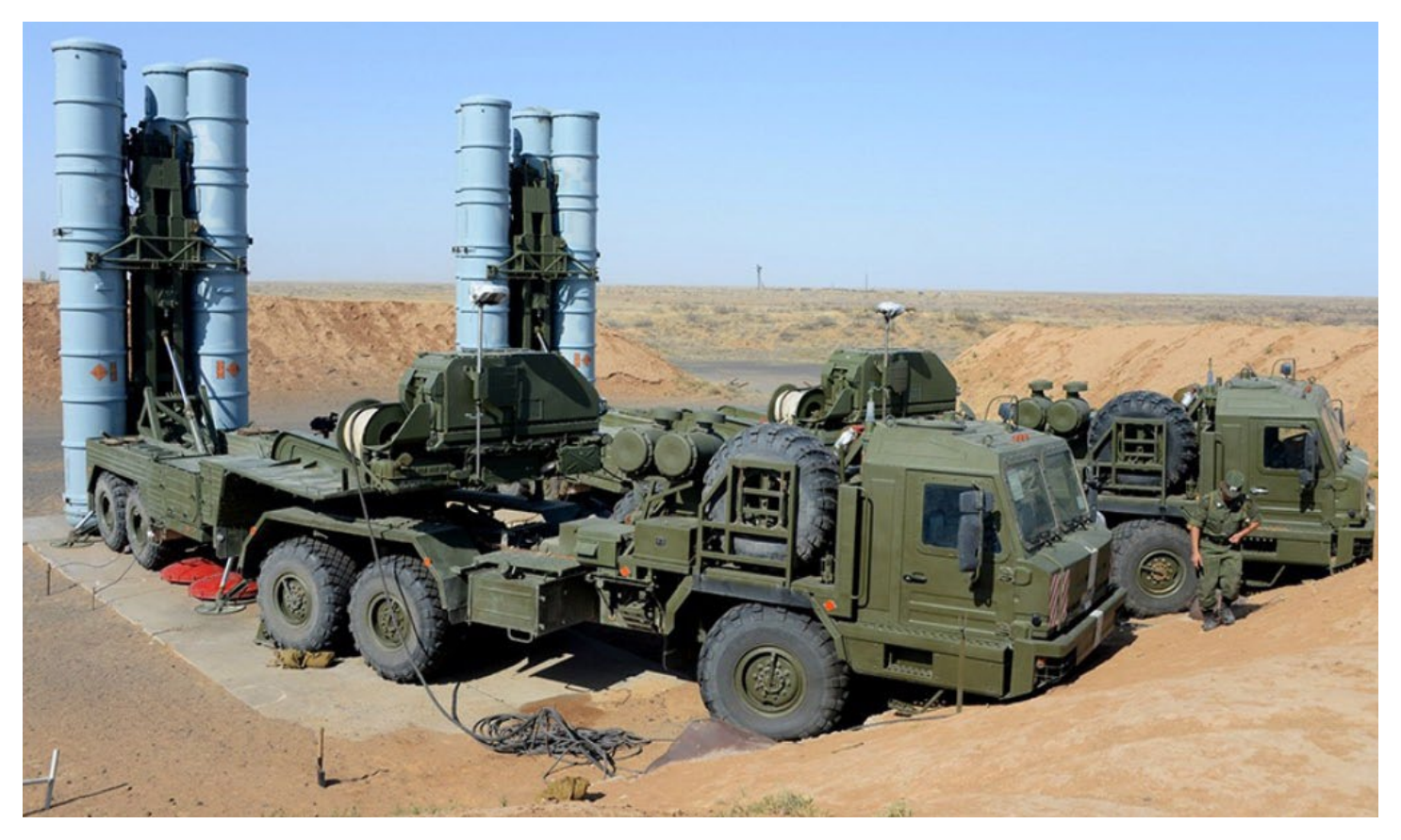
Russia is resupplying the Syrian Army with S-300 systems.

China's HQ-9. These systems, which are made up of multiple launchers, are highly mobile and use a range of missiles to be able to engage aerial targets as far away as 400km (250nm). Using new radars and digital fire control systems, they are also much more resistant to electronic warfare (EW) attacks such as jamming or spoofing than previous generations of SAMs. It is important to remember that these batteries, such as the S-400, also do not deploy alone – but will be protected by shorter-range SAMs such as the Tor M1 & M2 or SA-22 Pantsir - able to swat precision guided