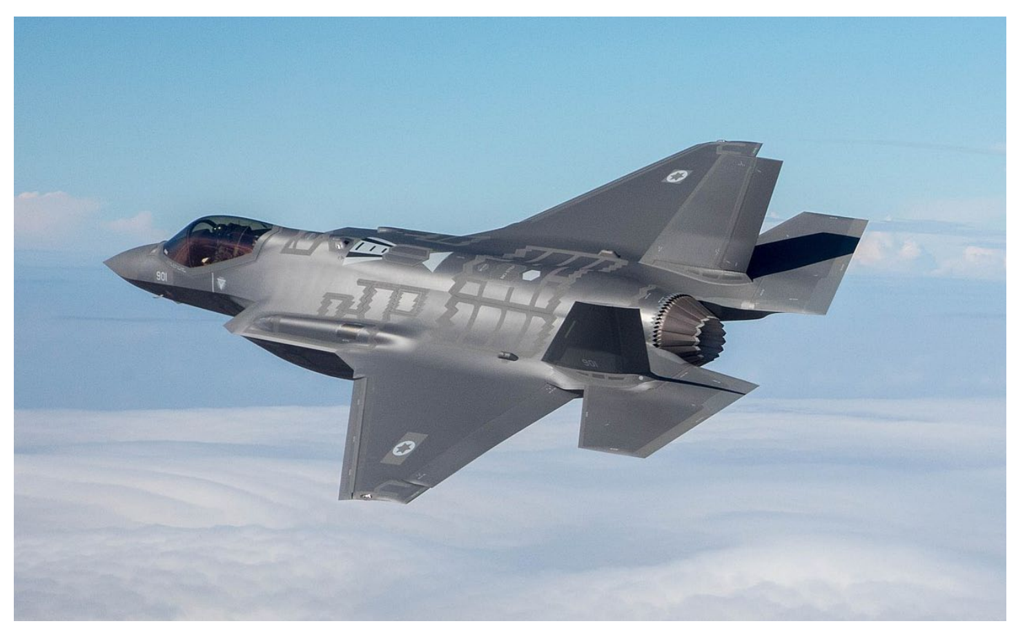
IAF F-35I in flight.

In short, the Israeli Air Force already has much experience in going-up against the latest generation of SAMs and IADS, With Iran proxies active in Syria and assisting in the country's air defences, the IAF has undoubtedly already learned lessons about how to 'peel the onion' of the latest 'triple-digit' systems. How Israel uses new technology and tactics, from stealth fighters to stand-off weapons, to tackle 'triple digit' IADS networks will thus be of immense interest to other Western powers in the 21st century - as these modern SAMs proliferate around the world.