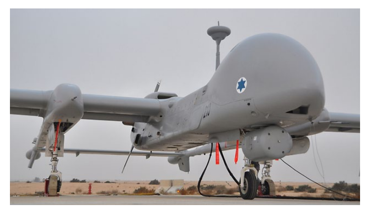
Israeli Heron Drone.

Finally, these Russian and Chinese-built SAMs are not just a concern for large-scale peeron-peer conflict in the Baltics or South China Sea. Russia has deployed its S-400 to its Syrian ally and the SAM has been exported to other nations including, Belarus, China India, Saudi Arabia and most controversially, Turkey - a causing a massive spilt with the US. Meanwhile China's HQ-9 has been exported to Morocco, Turkmenistan and Uzbekistan. The global proliferation of these advanced SAMs thus means that countering them will be a key challenge for many air forces in the 21st century