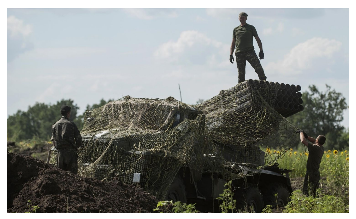
Ukrainian troops camouflage their multiple rocket launcher at a checkpoint in Kryva Luka, in eastern Ukraine.

More than two years since Moscow stunned the world with its annexation of the Crimea, the conflict in eastern Ukraine has descended into an uneasy stalemate between the Kiev government and breakaway pro-Russian forces mainly composed of ethnic Russians. It seems likely that Moscow's intent was not to occupy Ukraine and send tank divisions to Kiev, but to covertly