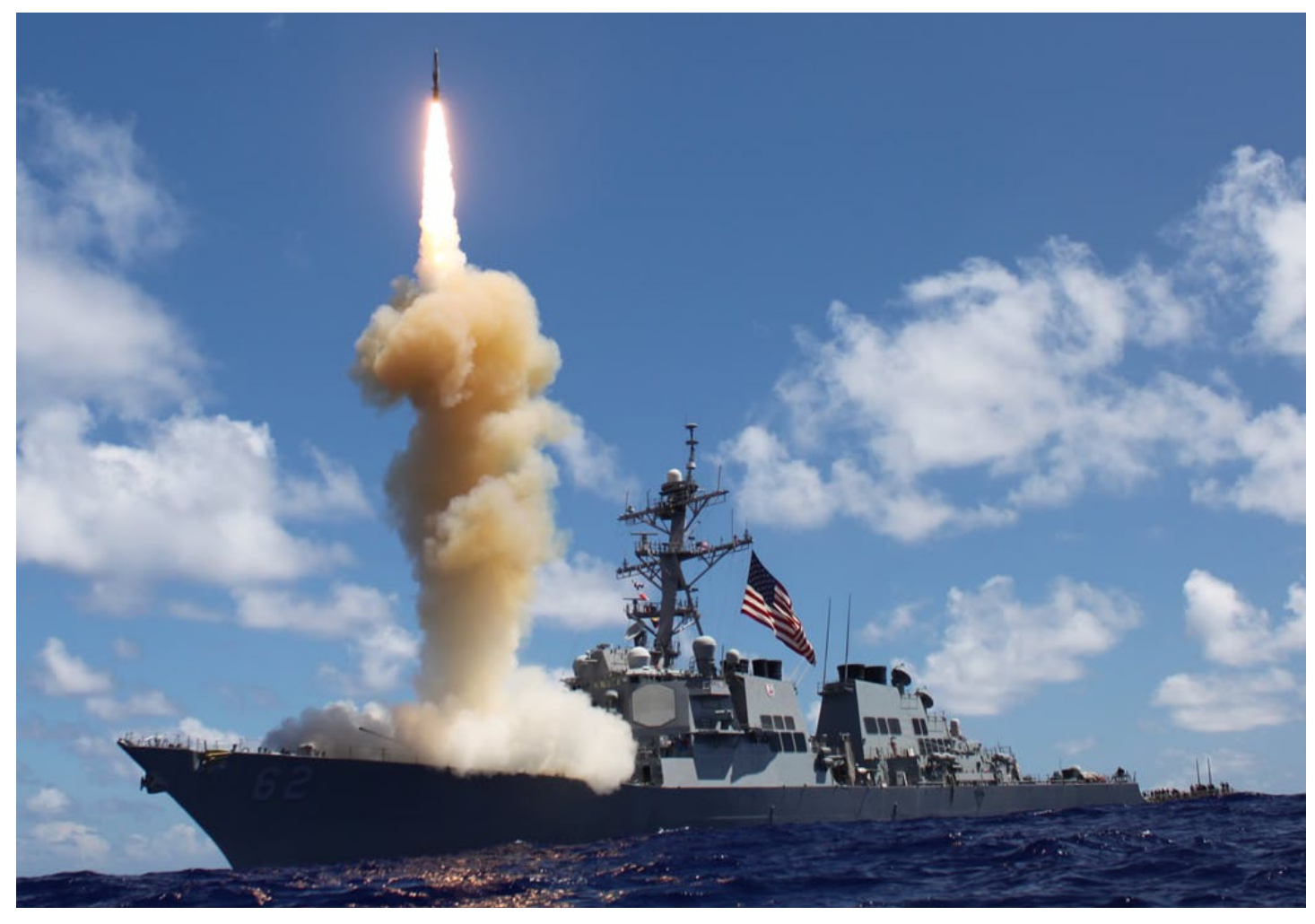
Standard SM3 missile being launched from US Fitzgerald.

In short then, finishing off this 'frozen conflict' for once may be appealing to Moscow for a number of reasons. With the West distracted by Syria and the probes in the Baltics, a short campaign, backed this time by Russian air power and the Black Sea Fleet could bring ethnic Russians back into greater Russia, secure part of its lost defence industry and complete a land bridge to Crimea. An open military defeat of Ukraine would also have the effect of the government in Kiev falling, potentially to be replaced by a more Moscow-friendly regime. While an outright invasion makes the risk of a direct NATO involvement also higher, the potential rewards, that of undermining and splitting the alliance permanently also are larger.