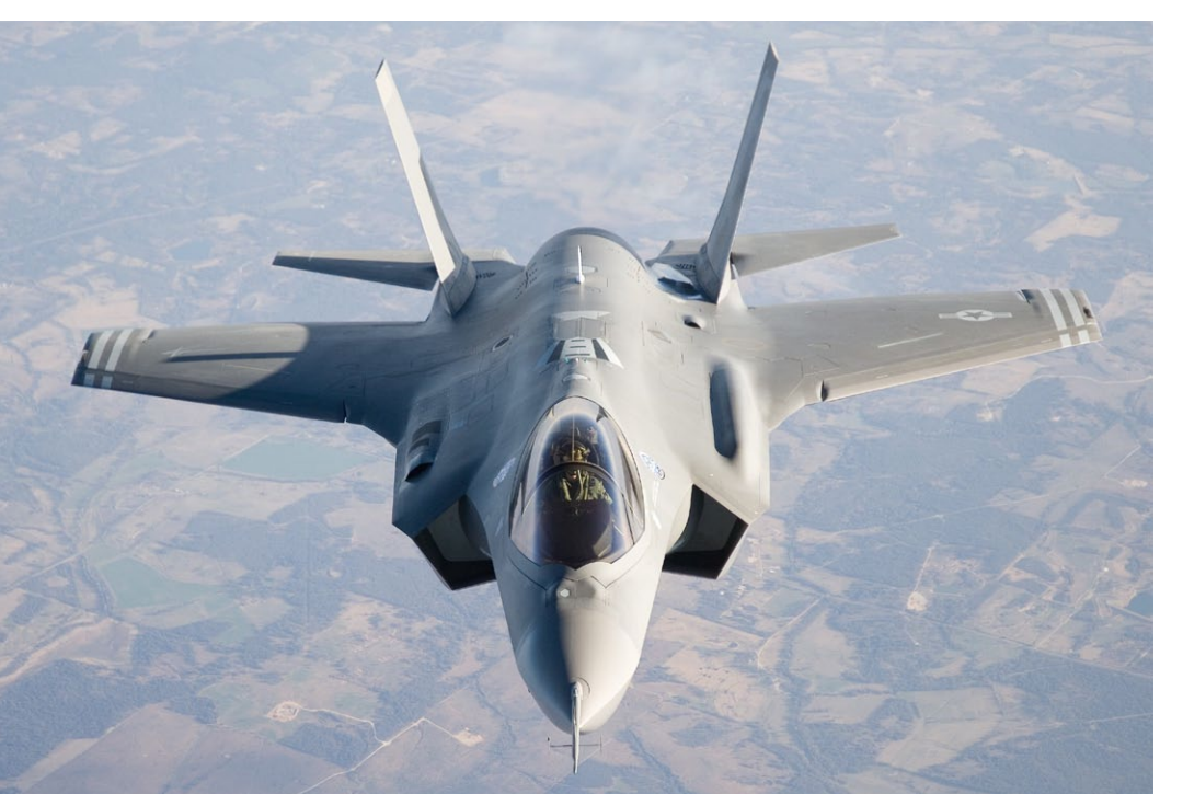
Lockeed Martin F-35 Lighting II.

For a peer-matched opponent like Russia, it is thus highly probable that the US will want to call on its F-35As for the most dangerous missions in contested airspace. Likewise, if Moscow was facing advanced NATO air power as well as Ukraine, it too might consider an operational