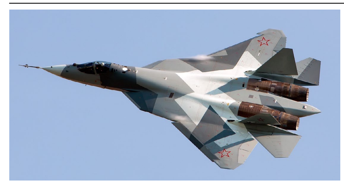
Russian Sukhoi T-50 PAK-FA Stealth Fighter.

test deployment of the PAK-FAs to help give it the battle-winning edge. Though risky, it is not without precedent. Russian for example tested Ka-50s attack helicopters in Chechnya in the 1990s while the US deployed JSTARS and Global Hawk to operations before they were officially ready.