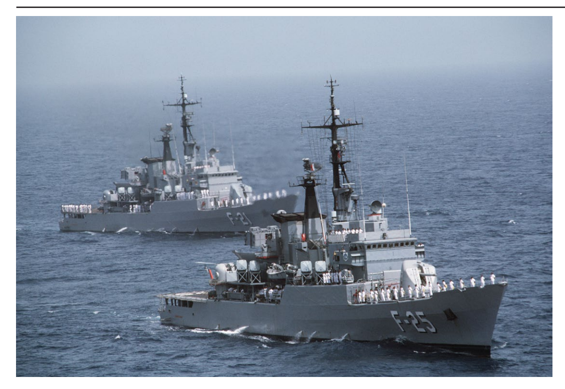
A starboard bow view of the Venezuelan frigates General Salom (F 25) and the Mariscal Sucre (F 21) underway. The ships are transporting Venezuelan officials.

However, it was also in Cuba, in 1962, when Russian intermediate nuclear missiles were secretly deployed in the US's own backyard, that brought the superpowers to the closest to Armageddon – with a US naval blockade leading to a