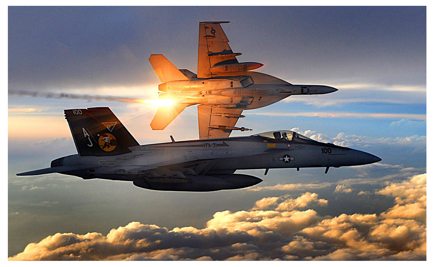
Two U.S. Navy F/A-18E Super Hornets. The aircraft in the background is deploying infra-red flares.

Though the slow-motion collapse of Venezuela's economy and resulting security headache for Colombia may seem like a regional issue between the two countries, wider Cold War 2.0 geopolitics driven by Russian adventurism and Moscow's fears that the US may sanction 'regime change' against its Caribbean ally may provide the spark to escalate off a wider conflict. Can for example, the US sit back while another Syrian-style civil war erupts right on its doorstep, and Russia taunts it with a nuclear dagger aimed at America's throat?