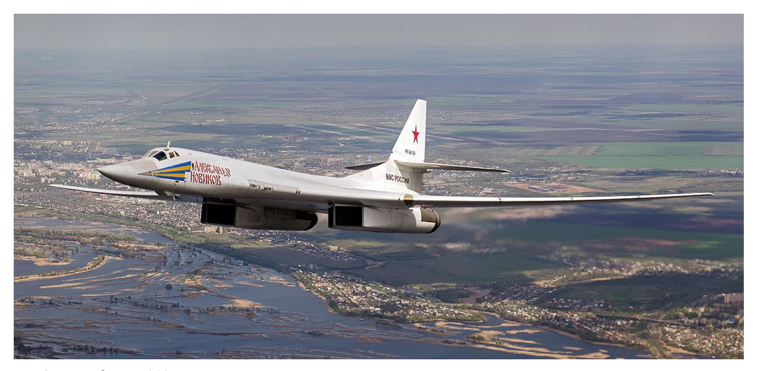
Russian Tupolev Tu-160.

Russian bomber flights to the Caribbean themselves are nothing new and Tu-95 Bears regularly made visits to the the USSR's close ally of Cuba, during the Cold War. These operated from the island as temporary detachments to support Soviet submarine forces off the eastern coast of the US.