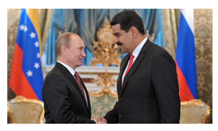
Venezuela welcomes Russian bombers in support for Maduro.

The latest news that the US intends to withdraw its forces from Syria, is thus a tacit admission that Russia has 'won' this particular geopolitical wrestling match.